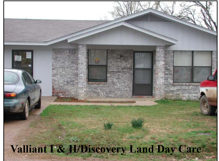
Valliant I & II/Discovery Land Day Care