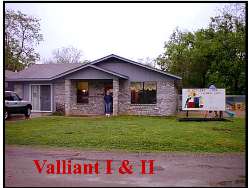
Valliant I & II