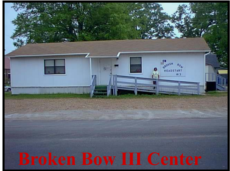
Broken Bow III Center