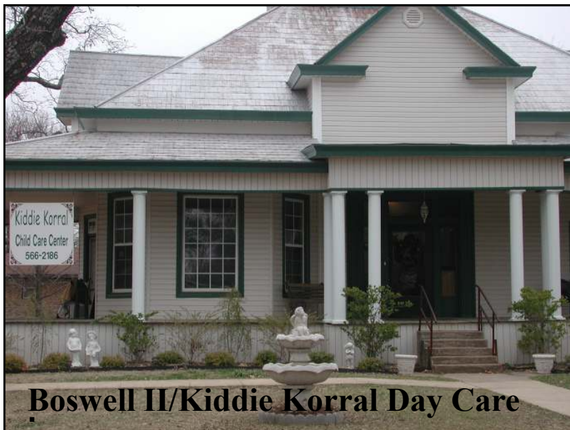
Boswell II/Kiddie Korral Day Care